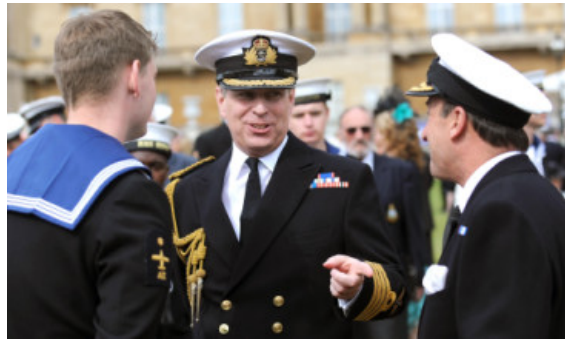
Prince Andrew 'grateful' for apology after police challenge